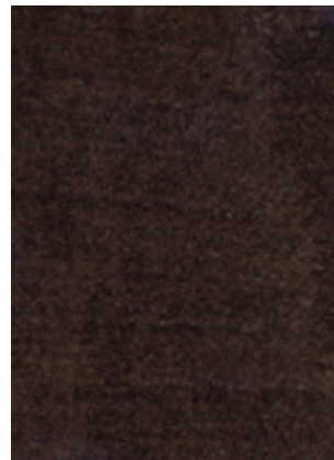
Chocolate | 207