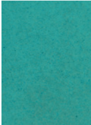
Aqua | 200