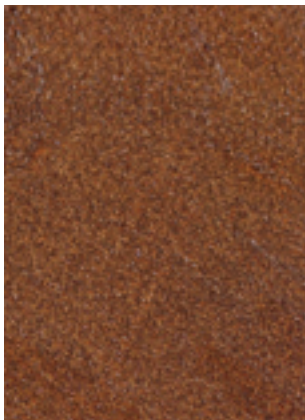
Canyon | 205