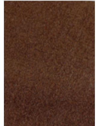
Bronze | 204