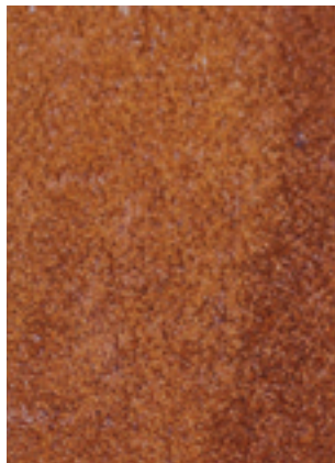
Autumn Leaf | 201