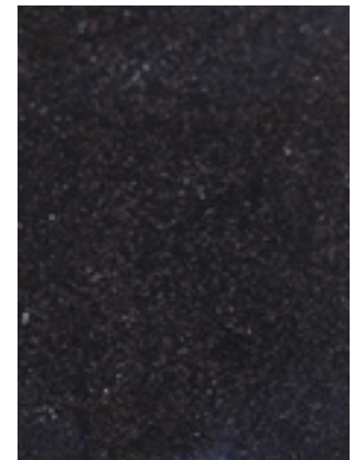
Walnut | 209