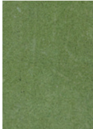
Avocado | 202