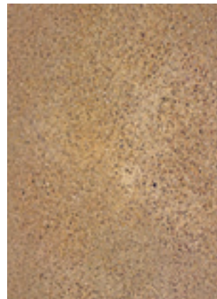
Blonde | 210