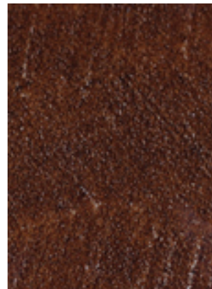
Chestnut | 206