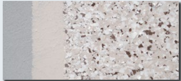
Concrete Primer (Full) Topcoat Broadcast