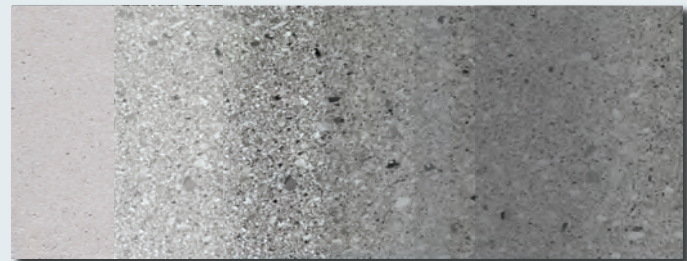
Concrete Temper-Crete Coat & Broadcast 2nd Broadcast Coat Polyaspartic Topcoats Polyurethane Sealer