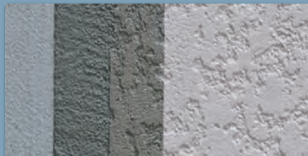
Primer Slurry Knockdown Color and Seal Texture