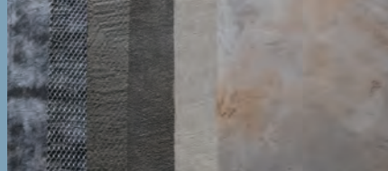
Sheet Membrane Lath Base Coat Slurry Coat Grout Coat Custom Finish