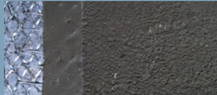
Sheet Membrane w/ Metal Lath Base Coat Slurry Coat