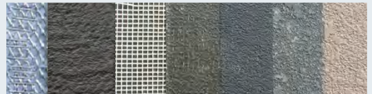
Sheet Membrane w/ Metal Lath Base Coat Fiberlath w/ Resin Membrane Slurry Coat Texture Coat Topcoat