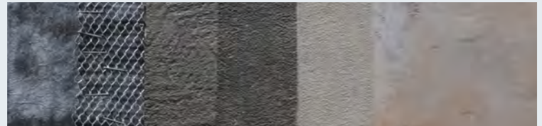
Sheet Membrane Lath Base Coat Slurry Coat Grout Coat Custom Finish